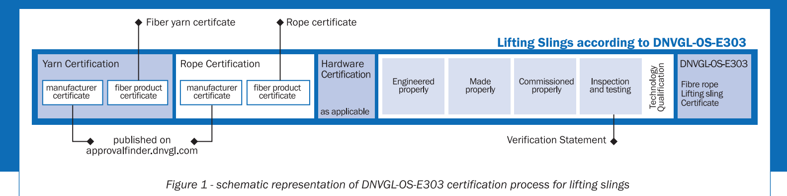
Figure 1 shows the schematic representation of the DNVGL-OS-E303 certification process for fibre rope slings. From this certification process, some deliverables (documents) can be extracted, like a Verification Statement for a test that was performed. However, if out of context, these documents do not provide a meaningful understanding of the slings characteristics or performance.

After rope production, the sling assembly process is also verified and all the steps regarding Effective Working Length, length tolerances, splicing etc. are assessed. Finally, any tests regarding sling performance, endurance, splice integrity, etc. are reviewed as part of the final certification. Only if everything is in agreement with the both the performance requirements and the standard's requirements to documentation will the certificate be issued.