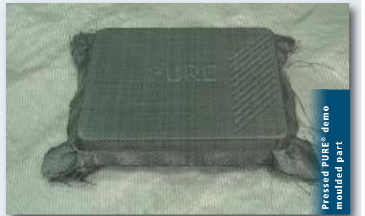
Pressed PURE® demo moulded part

PURE® however, behaves differently from many other thermoplastic materials. Therefore in the past year time and effort were invested in order to better predict the behaviour of PURE® in moulding processes (simulation capabilities). This was done together with Aniform, a spin-