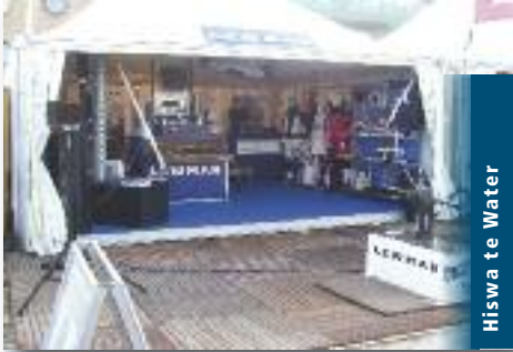
Hiswa te Water

The 'Hiswa te Water' show - also known as the 'Wet Hiswa' - will be held again from 31st August through 5th September in Marina Seaport IJmuiden, the Netherlands.