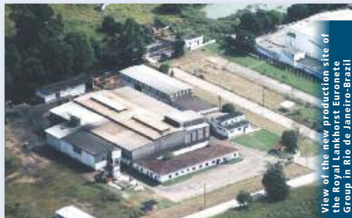
View of the new production site of the Royal Lankhorst Euronete Group in Rio de Janeiro-Brazil

This development is also in line with the recent investment that was made in Goa – India for the production of twines and ropes for the local fishing market.” The Dutch/Portuguese Royal Lankhorst Euronete group employs approximately 1100 people. The company has six